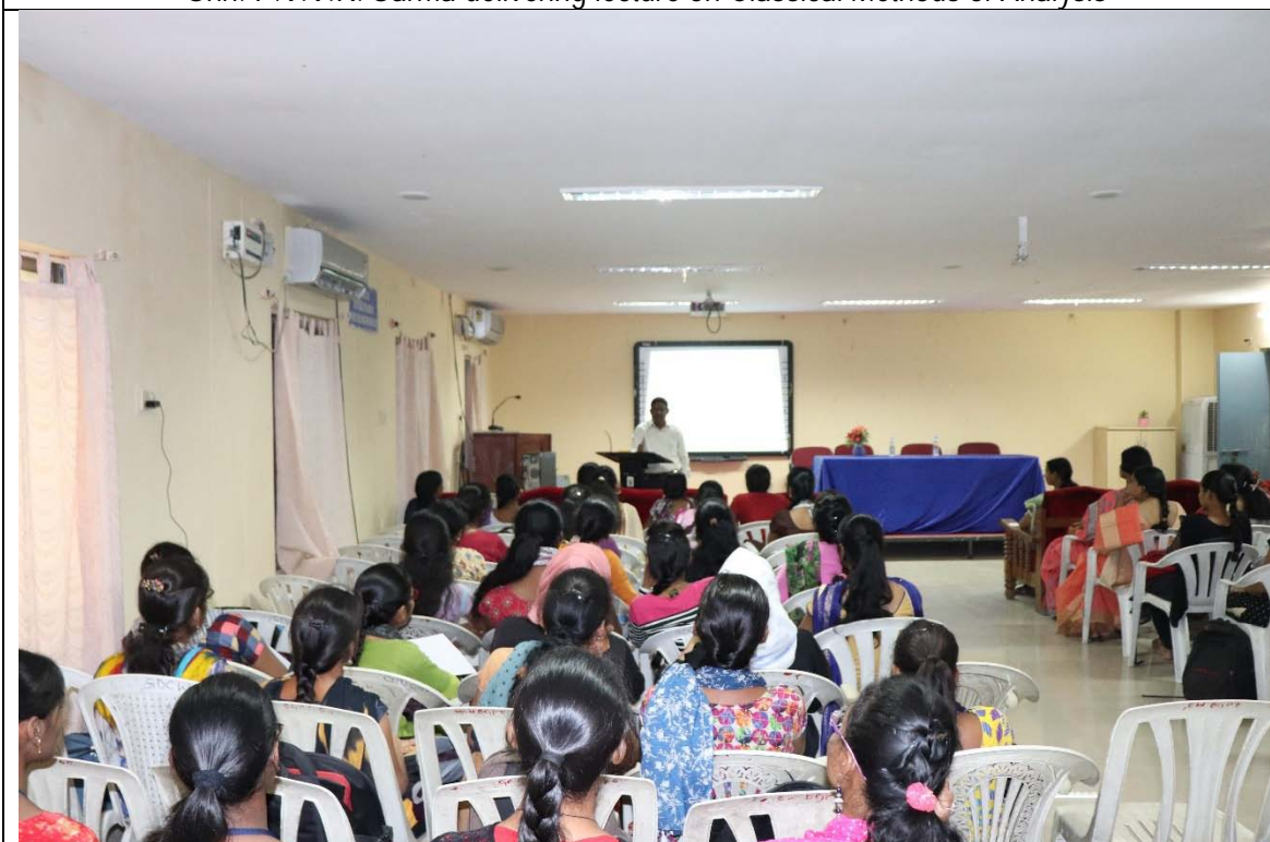
Case Studies on Applications of analytical Chemistry by Shri. P.V.V.R.Sarma