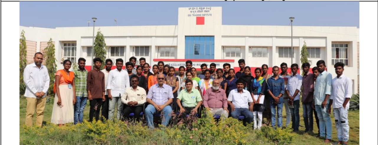
Group photograph of the students and faculty of GSITI