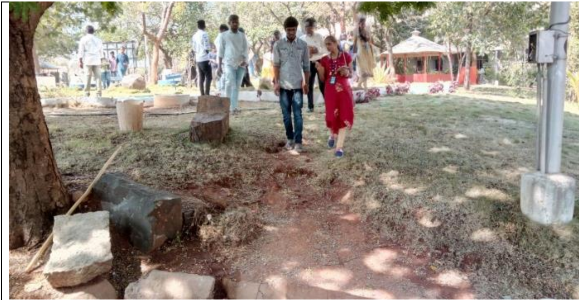
Students at the Geological Rock Park