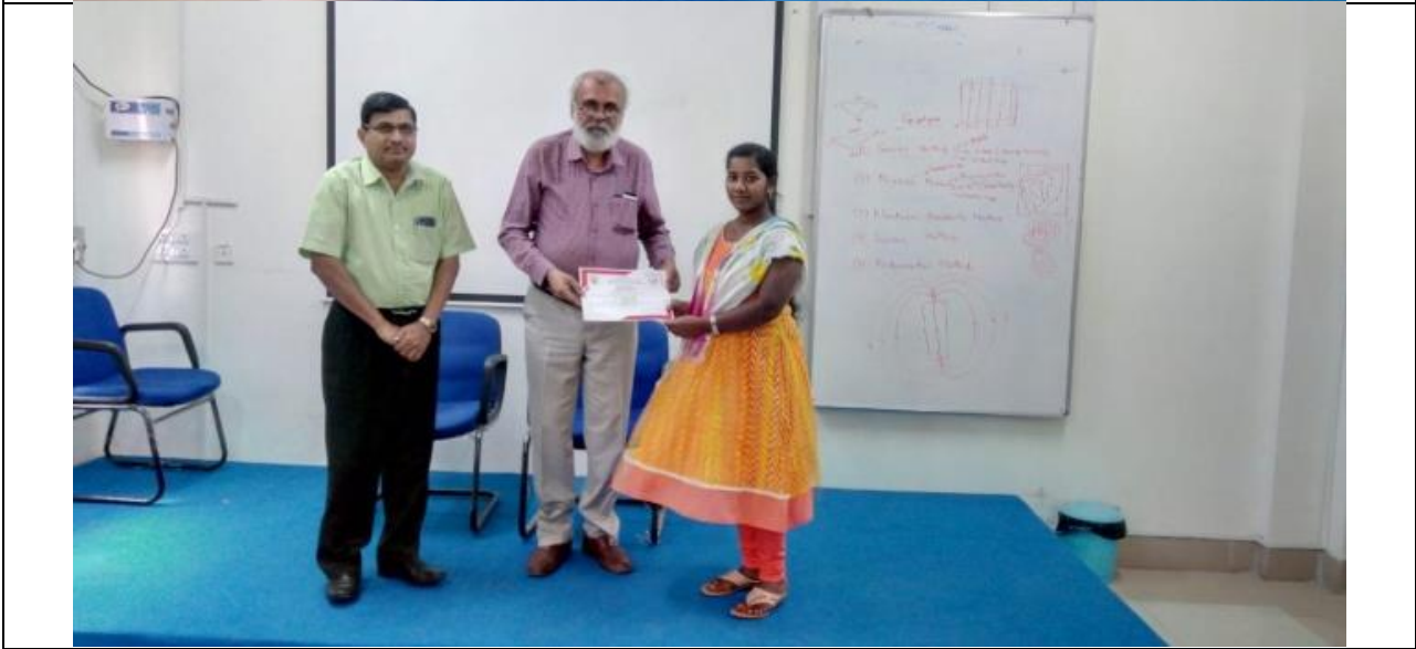
Certificate distribution to the student trainees of Nagarjuna College, Nalgonda