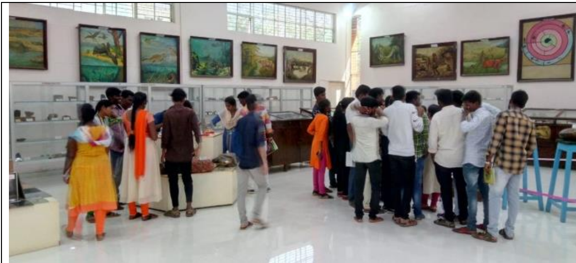
Students at the Geological Rock Park and Museum, GSI, SR