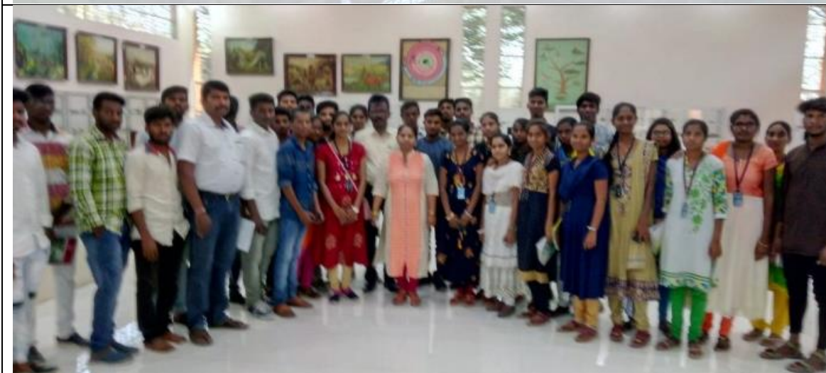
Students at the Geological Museum, GSI, SR