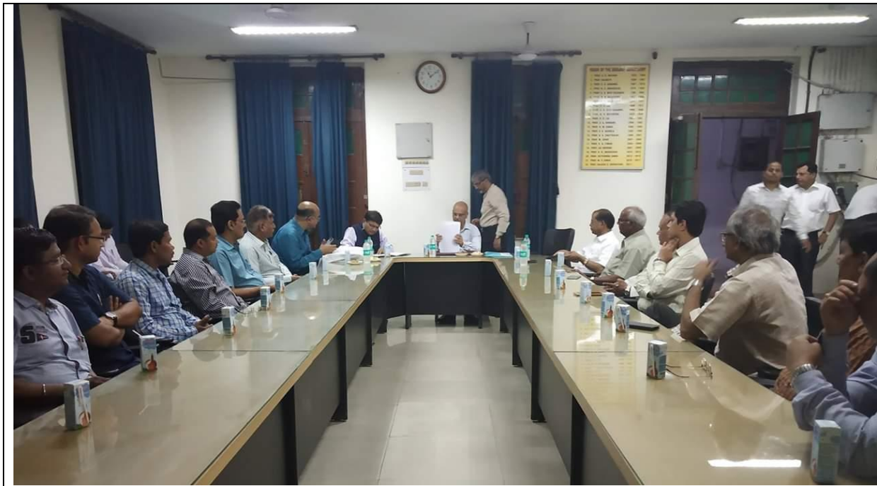
GSITI and BHU delegates during signing of MoU on collaboration for Academic and Research Programmes