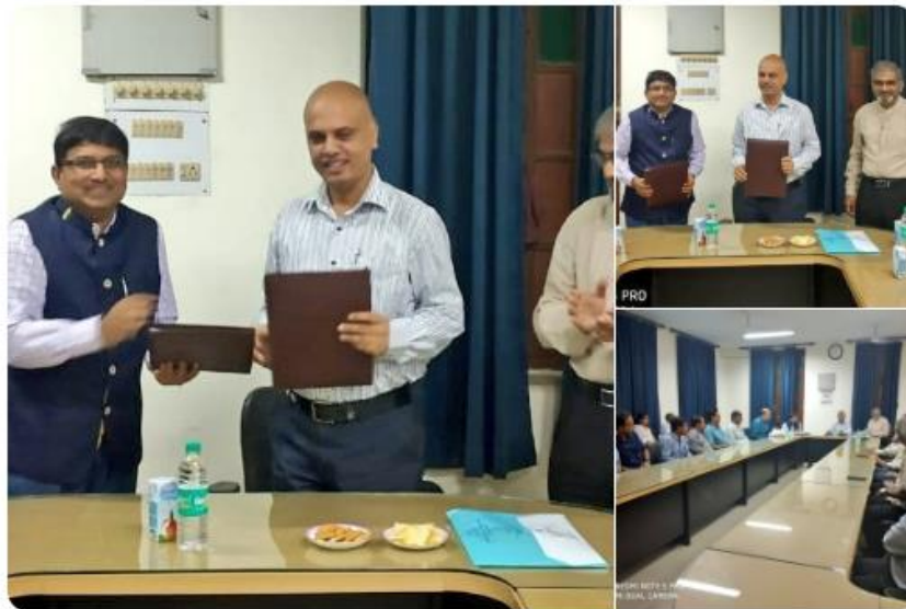
MoU between GSITI and BHU shared on https://twitter.com/VCofficeBHU

To promote research and training, a MoU was signed between Geological Survey of India and Banaras Hindu University today at Department of Geology, Instt. of Science.