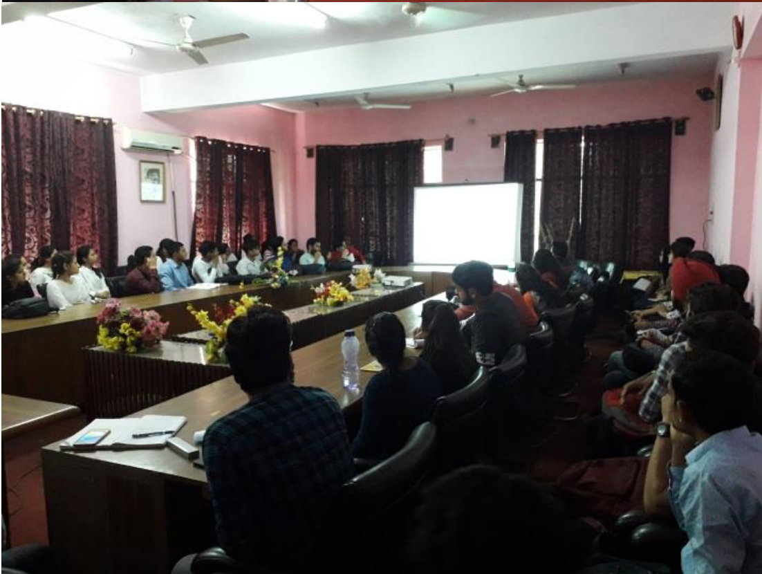
STUDENTS PARTICIPATION AT GMS COLLEGE, JAMMU