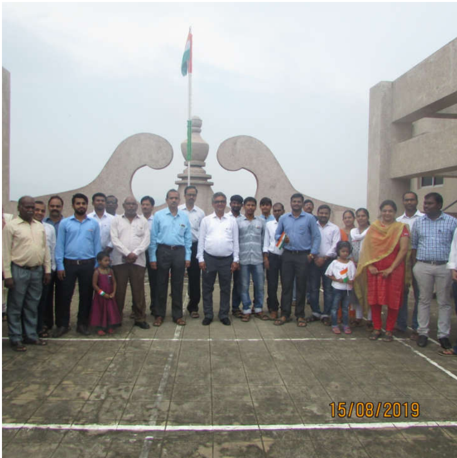
Officers and staff of Op:EC-II, MCSD, GSI, Visakhapatnam