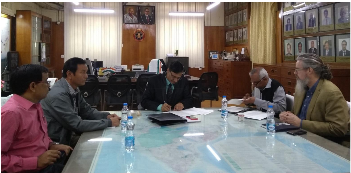
Signing of the MoA by Director General, GSI and representative of IDPeX Private Limited