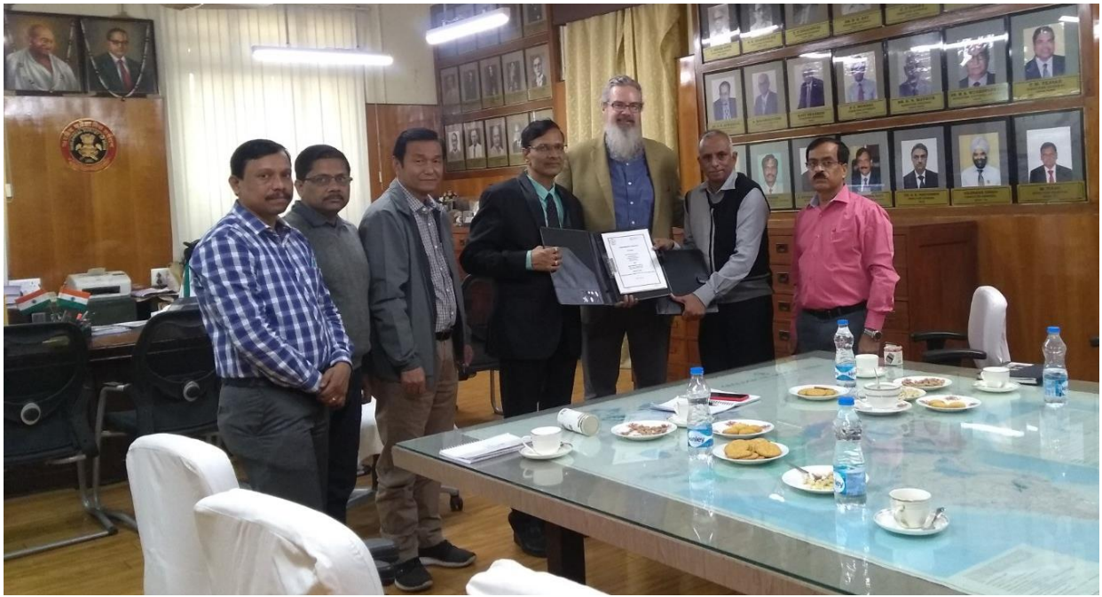
Exchange of MoAs between GSI and representative of IDPeX Private Limited